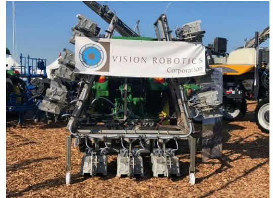
Easy to purchase – Easy to use