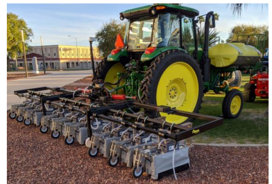
Simple and modular