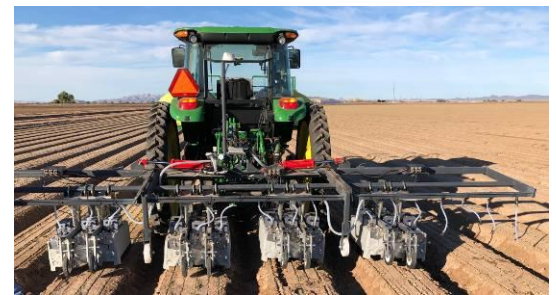
Easy to setup for any configuration This shows a 3- bed setup for 42" beds